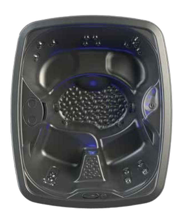
It's as EASY as one, two, three